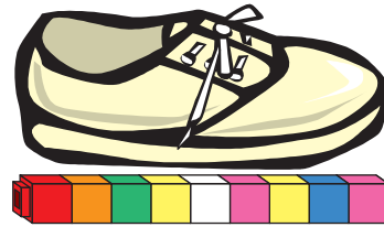
Measuring shoe length with cubes